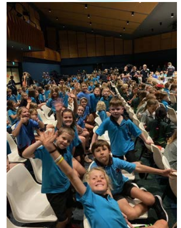
Years K-3 at this weeks Hiccup! Performance at Murwillumbah Theatre. What fun they had!