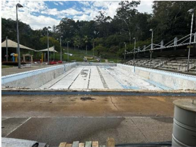
Restoration is in progress on TRAC's 50-metre outdoor pool at Murwillumbah.

For more information, including opening hours and charges visit TRAC's website .