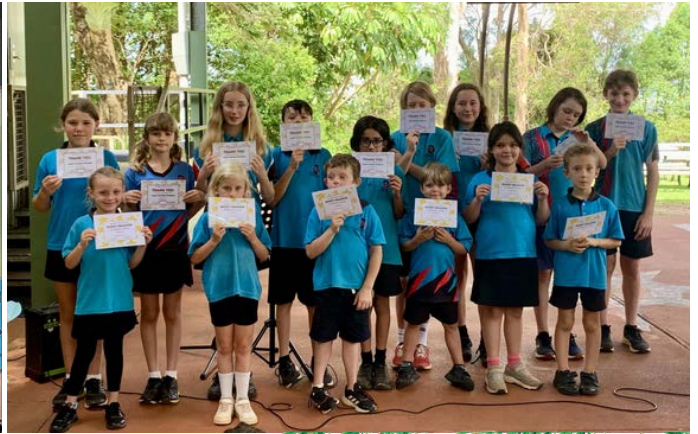
Buddy Reading Award Winners