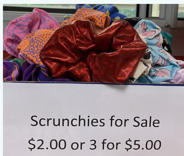
Scrunchies for Sale $2.00 or 3 for $5.00