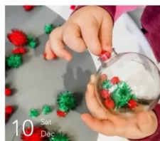
Mini Crafters Christmas