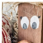
Let's make Rudolf - 19th December

BRUNSWICK HEADS TUESDAY JAN 17TH BANGALOW WEDNESDAY JAN 18TH LISMORE (BEXHILL) THURSDAY JAN 19TH