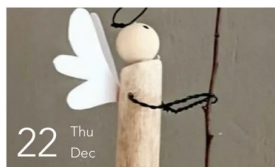
Christmas decorations at the Farm - 22nd December