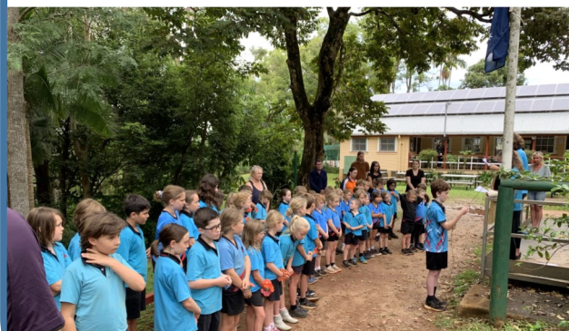
Remembrance Day 2021