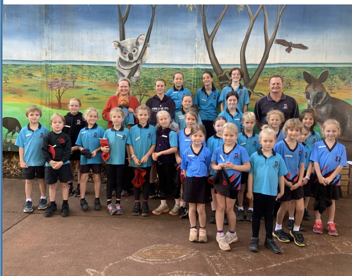
Our SRC Club