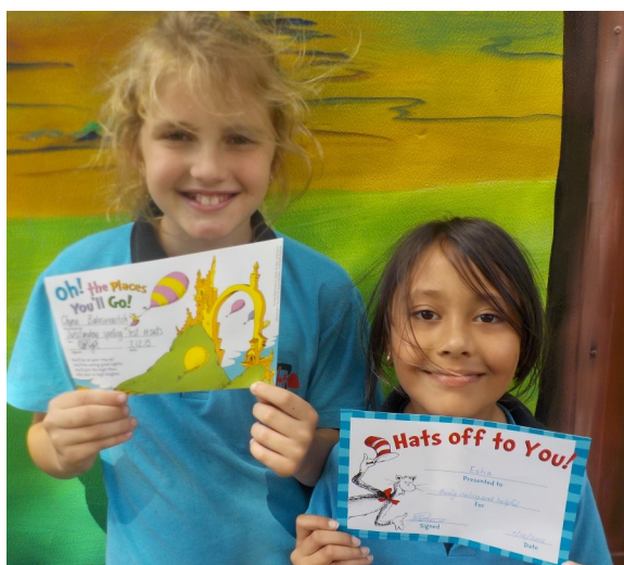
Primary Week 8