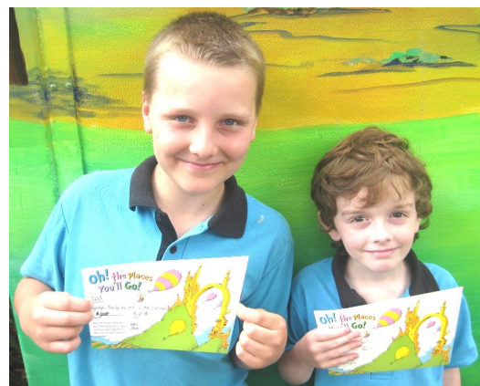
Primary Week 5