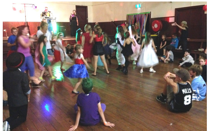
Disco night with Duranbah and Tumbulgum PS students dressed as their favourite super hero's