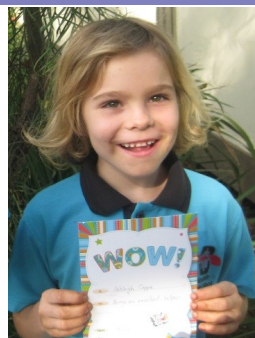
Infants Week 4