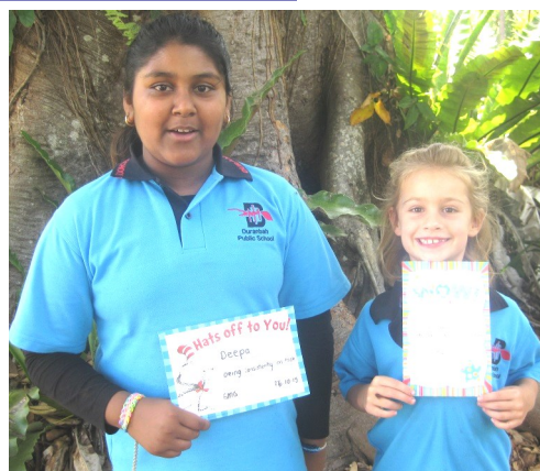
Primary Week 3