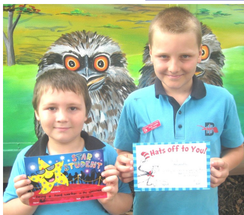
Infants Week 2