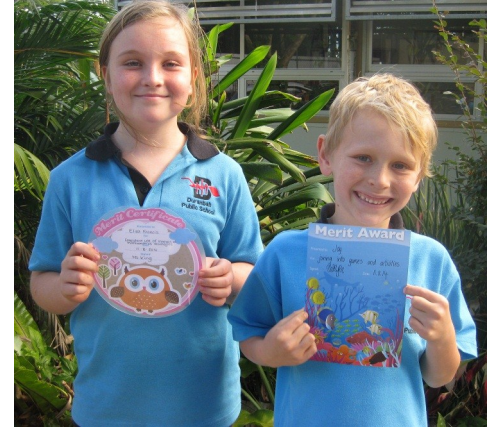
Primary Week 5