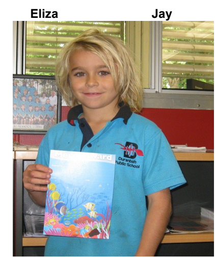
Infants Week 6