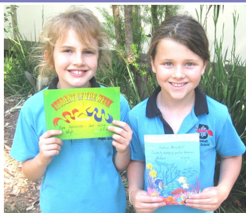
Infants Week 2