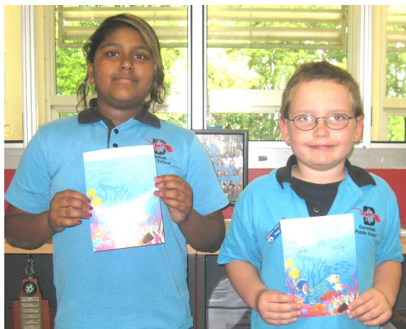
Primary Week 3