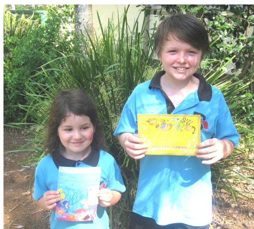
Primary Week 4