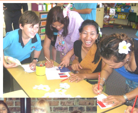
A Multi Cultural Week at Duranbah PS

☺ Tuesday 18 December-Duranbah PS Presentation Day