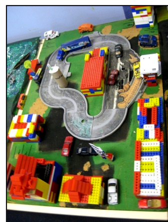
Primary Students Development Projects