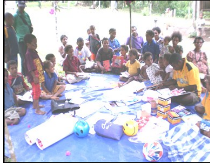
Ms Young explaining & showing the village donated school resources.

END OF YEAR PRESENTATION Tuesday 13 December 6pm Preparation for the school's end of year presentation evening is increasing. The main production will be "Wonderland Adventures". No magic, mystery or unusual happenings, just a fun presentation including lots of colour, music and dance with some 'fab' characters. All students will be involved in the presentation and scenery etc. K-2 have already made some beautiful butterflies and Jake (Y6) is 'bristling' with ideas for stage props for our Y3 to 6 to make. Final characters will be allocated on the Years 3-6 students' return from camp in Week 4. Songs taught to date are: It's A Small World, All in the Golden Afternoon (lots of pretty things will colour this song), How Do You Do and Shake Hands (a fun song with dance), I'm Late (another very lively fun song). I am impressed with all the students enthusiasm and hope we can make it as successful as the Stewart House concert.