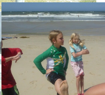
Action packed Camp Koinonia for all students