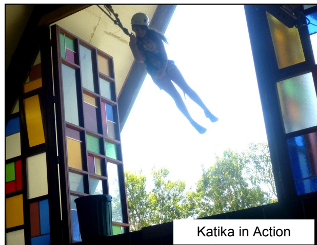
Katika in Action