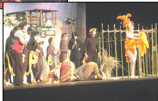
Duranbah Students interact with the performers