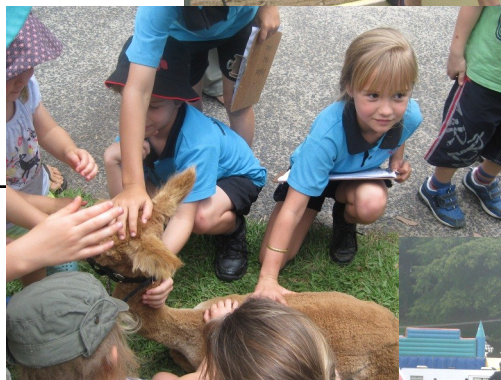
Duranbah Students having a great time at the Murwillumbah show