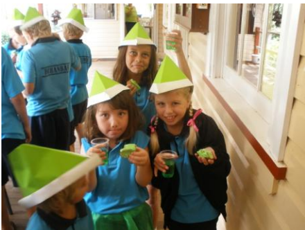
Students enjoying the green cake and drink.