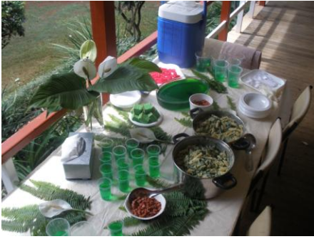
Wonderful table in the green theme.