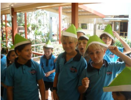
Green hats made by Fay for all the wear.